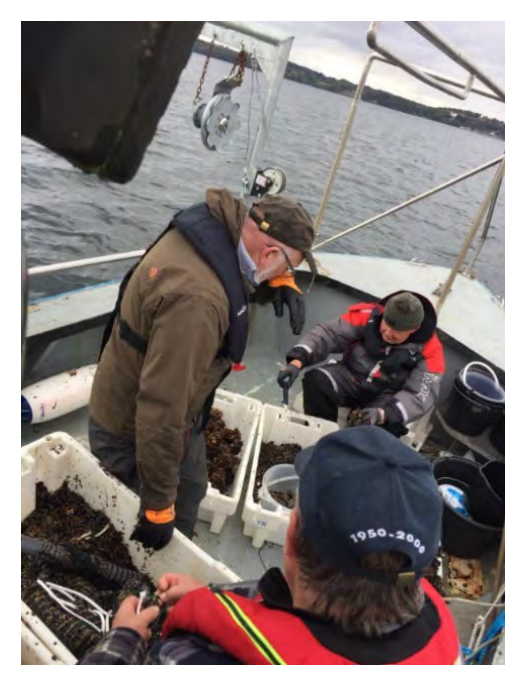
... on the lines it looks like everything is covered with grains of sand

The association "Vejle Fjordhave" currently has approx. 75 families and individuals as members. Every Tuesday and Thursday morning we have regular working days, when we sail out to the garden, weather permitting. Some members show up almost every Tuesday or Thursday, others only support financially, which is also very welcome. Those interested can follow us at <a href="https://www.vejlefjordhave.dk">www.vejlefjordhave.dk</a>