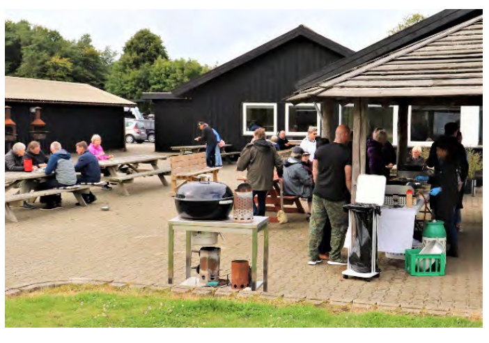
Mussel day in the harbour of Brejning