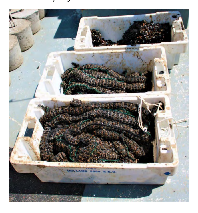
At work in the fjord garden