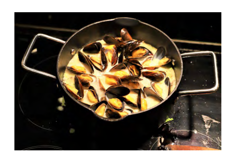
Delicious clam chowder