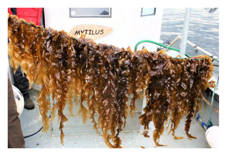
Sugar Kelp in April