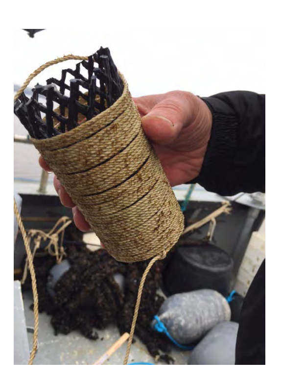
Refined Tang Linen